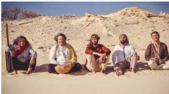
La Banda Morisca

Algazara provides a kaleidoscopic view of Andalusian culture, traditions, folklore and history through the artists we work with. But we do this from the universal perspective it naturally requires. After all, Andalusian culture is a crossroads of different civilisations and a land inhabited by different peoples, each of which have left their legacy to create its magnificent heritage.