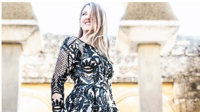
Al-Zahra in Music