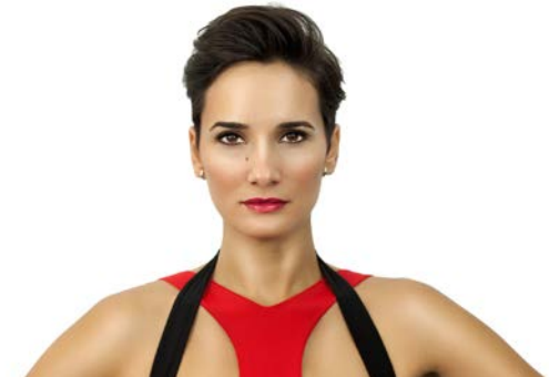
Hija de la Luna