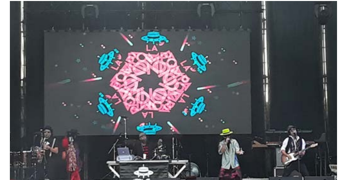
La Pompa Jonda