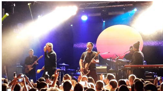
Los amigos invisibles