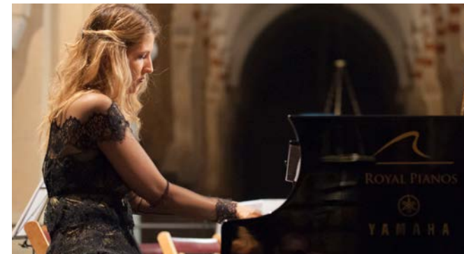
Images of Spain through dance